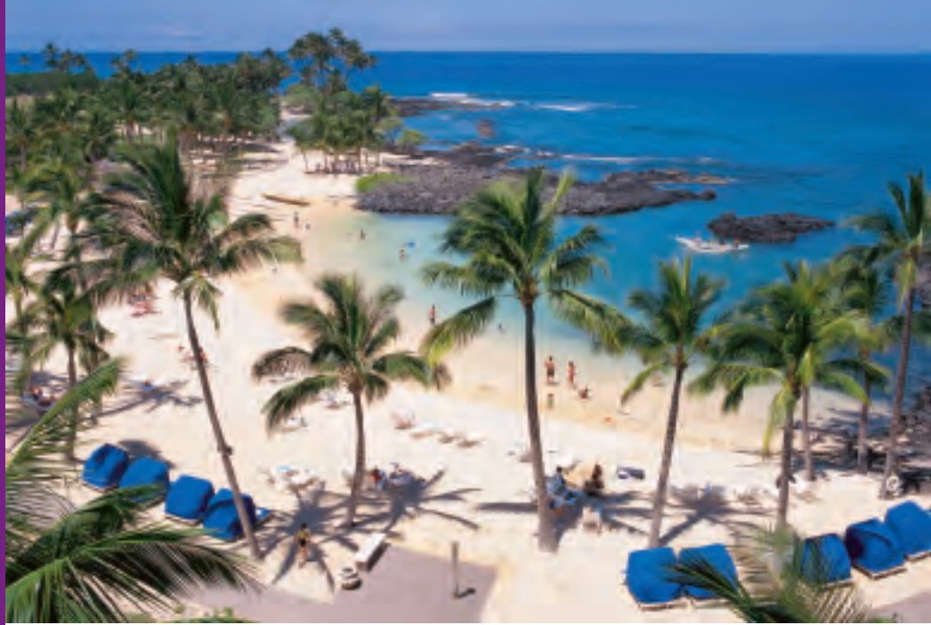
Indulge the senses from ocean-view rooms at The Fairmont Orchid