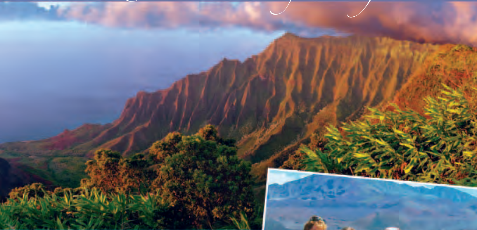
Hawaii's diverse landscapes await from coastal Kauai (above) to the Big Island's Hawaii Volcanoes National Park (right)