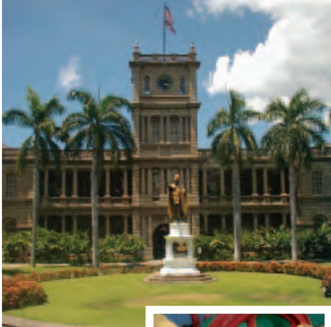
Explore Hawaii's heritage at sites such as Iolani Palace (above), Kona Coffee Living History Farm (right) and Pearl Harbor (below)