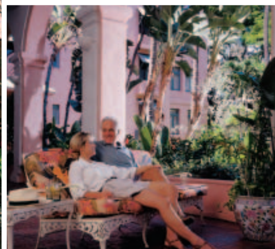
Royal Hawaiian Hotel – Honolulu, Oahu

Tour ends: Kailua-Kona Airport. Fly home anytime; a transfer to the airport is included. Allow a minimum of two hours for flight check-in. Meals B