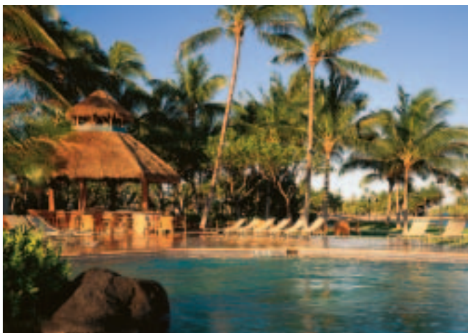
The Fairmont Orchid– Hawaii

Night 1,2,3 Royal Hawaiian Hotel (Historic Garden Rooms or Tower Oceanfront Rooms) Honolulu, Oahu Night 4,5,6 The Ritz-Carlton, Kapalua (Garden-View Rooms) Kapalua, Maui Night 7,8 Princeville Resort , (Ocean Rooms) Princeville, Kauai Night 9,10,11 The Fairmont Orchid, Hawaii (Garden-View Rooms) Kohala Coast, Big Island