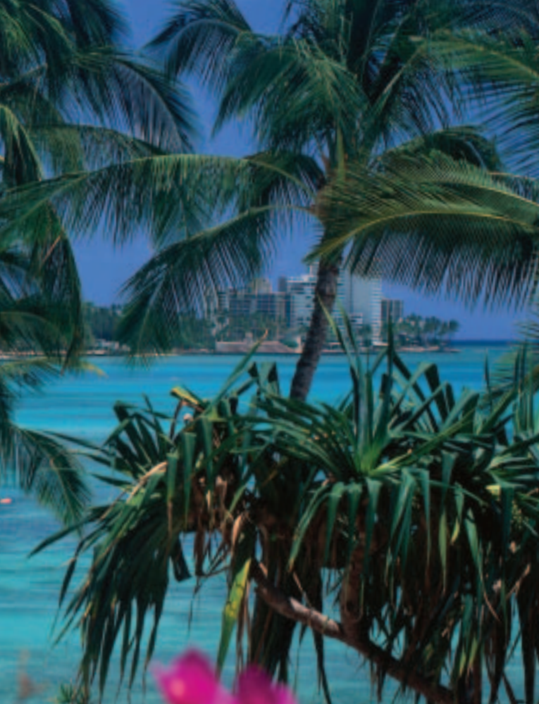
Waikiki Beach, Oahu